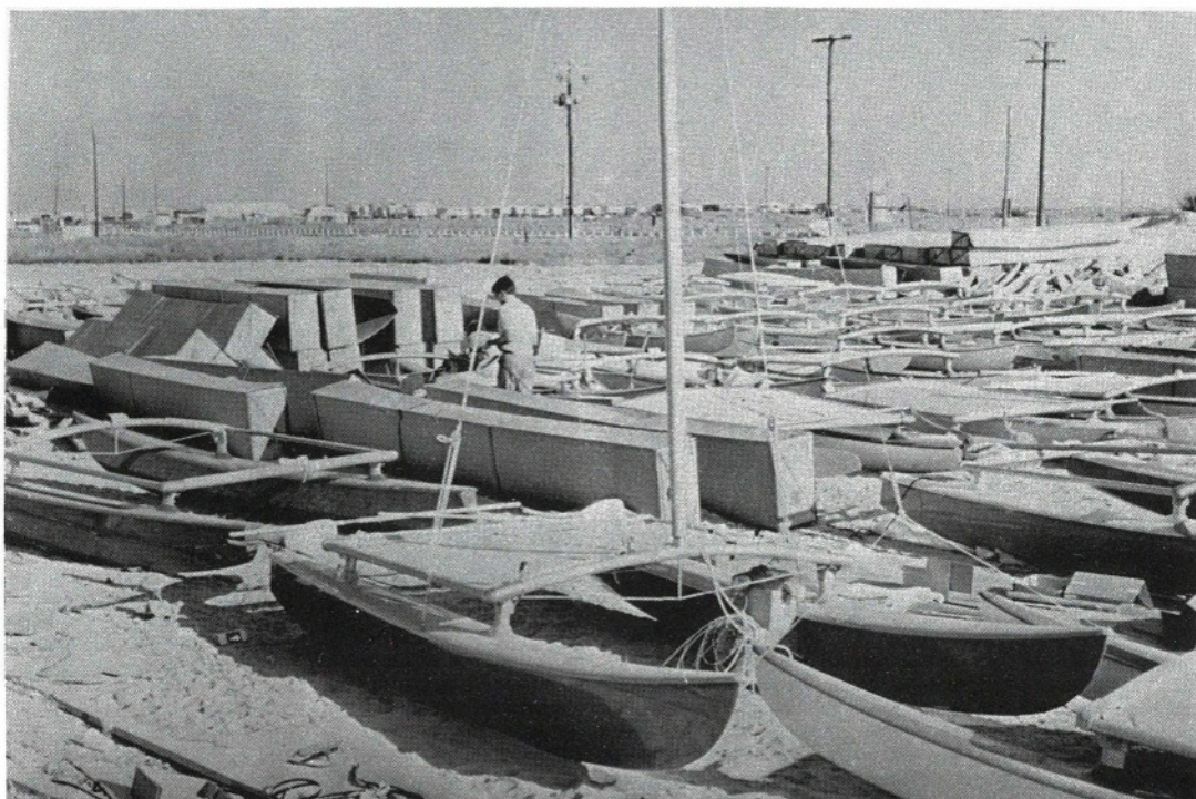
Acres and acres of Hobies. Over 120 Hobies, 240 cartons to be opened, assembled and assigned to participants. The logistics of the 1972 Nationals was astounding. Only Coast Catamaran could pull off an accomplishment like this, and all in the name of a good national regatta.